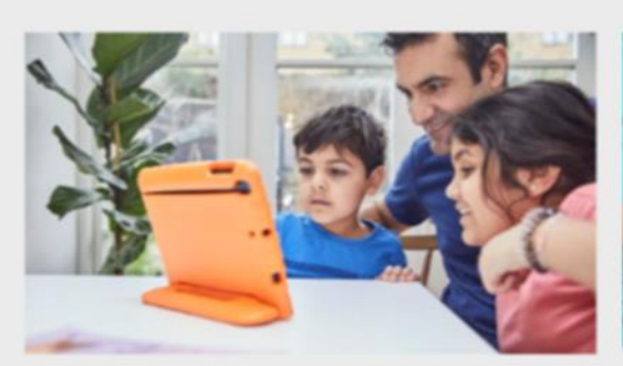
Talking to your child about online safety

Advice on how to start the conversation and get support if you're worried.